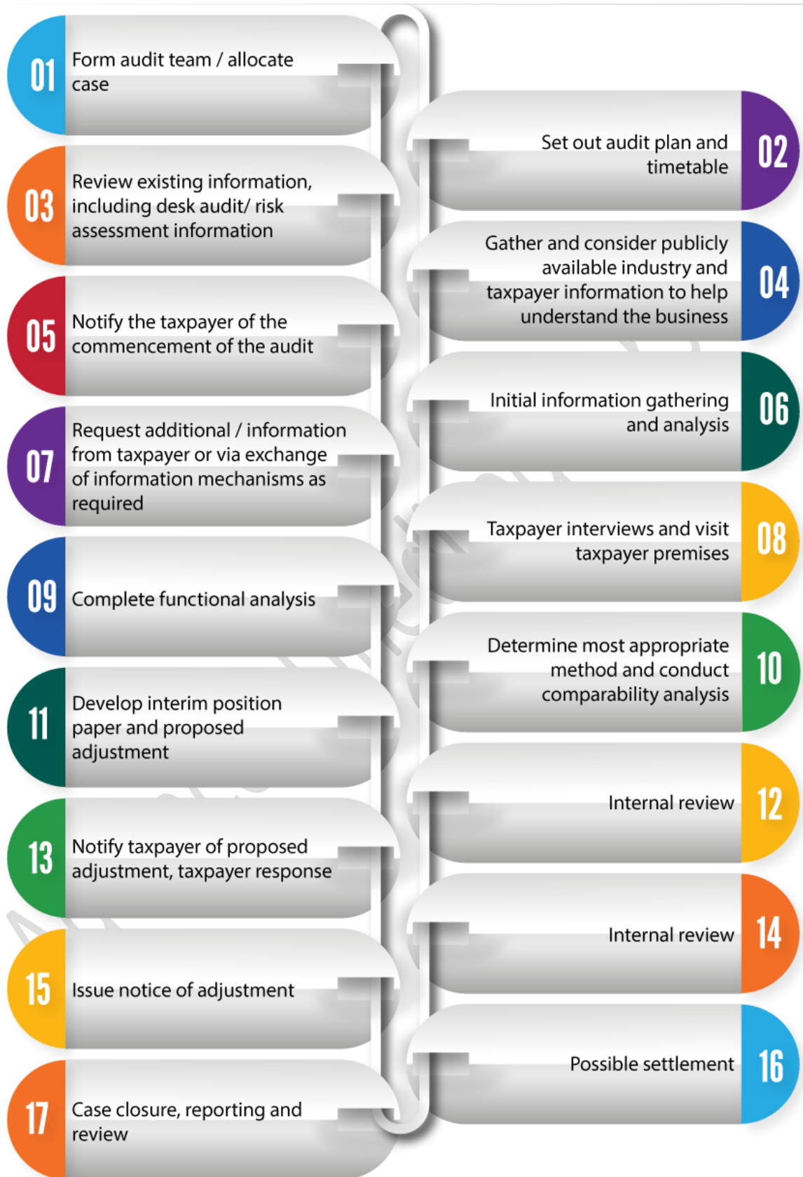
Box 3: Summary of Transfer Pricing Audit/ Examination Processes

Source: Based on Chapter 14 of the UN TP Manual